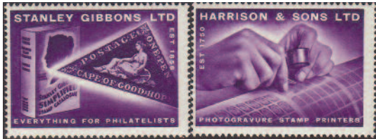
Circa 1950's Stanley Gibbons/Harrison & Son Ltd. Pair of Labels £7.50