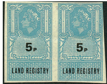
1972 5p (Pale Blue) Imperf Plate Proof on Gummed Watermarked paper (some slight wrinkling) ..... £3.50