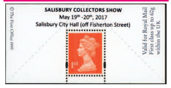
May 19th-20th, 2017 Boots Label Overprint Publicity Label. Only £3.50